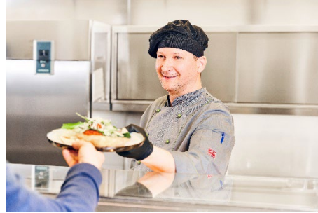
Dussmann Food Services