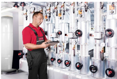
Dussmann Facility Management: maintenance