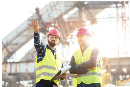
Dussmann Technical Solutions: Electrical engineering