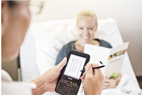
Dussmann Food Services: