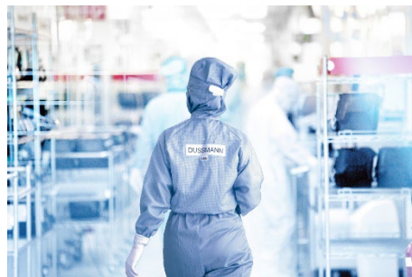
Dussmann Facility Management: whiterooms